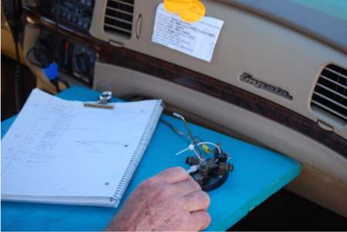
AB7RW Hand Key Fix