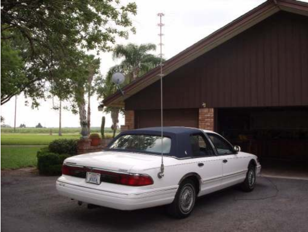
W9UCW 10, 12, 15, 17, 20, 30 and 40M on 8 foot mast

In addition to the extensive text and pictures, he includes files with the patterns to cut the resonators and winding data for how many turns to put on, and how to form the capacitor wires.