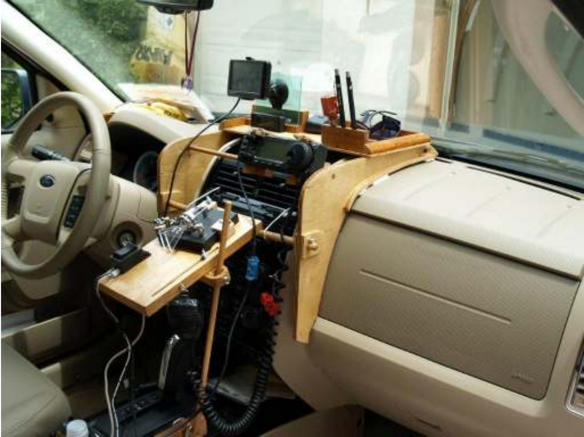
KA3DRO Mobile Install in the Escape