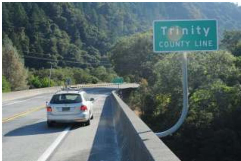
AI5P in Trinity CA – LC WBOW for KD4HXM

Ended up driving just over 5,000 miles and making over 1600 contacts - mostly on 20 and 40 meters SSB and CW. A handful of contacts on 17 and 30 meters. Managed to give out a few last counties with the special one being the WBOW for Master's Gold for Rufus, KD4HXM, in Trinity County, CA.