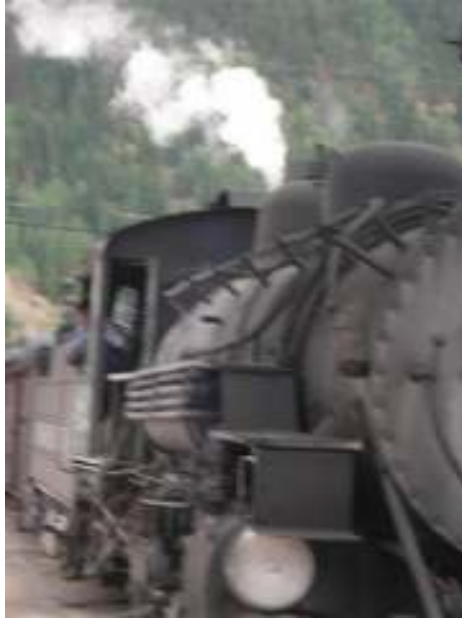
Durango Silverton Train

I picked the right day as two days before, there was a rock slide that shut the railroad down. None of the trains could get through and 1000 passengers were disappointed and sat for hours waiting for the track to be cleared. There was rock 20 foot deep on the tracks and they couldn't clear it fast enough. I suppose with progress, now you get to sit for hours at airports on planes waiting to take off – for six hours at times! Different century but same transportation woes!