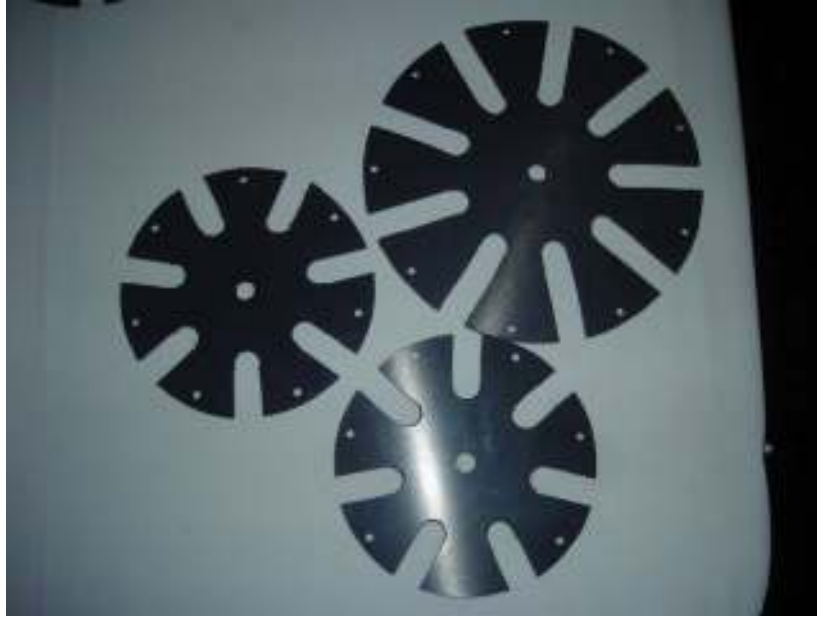
Resonator Plastic Discs to Start