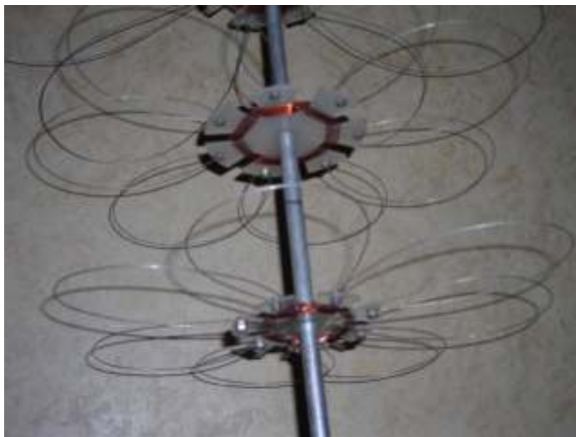
Resonators – Pie Wound ‘Flying Saucer’

A few issues ago, we showed pictures of the W9UCW ‘flying saucer’ flat pie wound resonators.