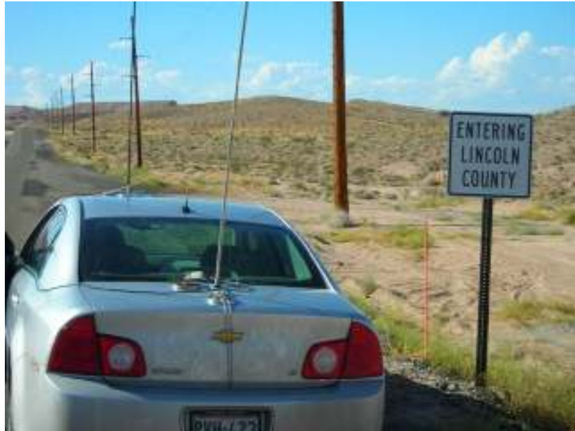
Lincoln/Clark, NV (20 over S9 noise!)

Mesquite is actually in Clark NV. I navigated to the road, and sure enough, the good news is that not only does it go to the county line, with a nice sign, it goes on for miles into Lincoln County. So does the power line along side the road that produces S9 plus noise on cw and 20 over on 20M SSB! You aren't going to run this county line on this road!