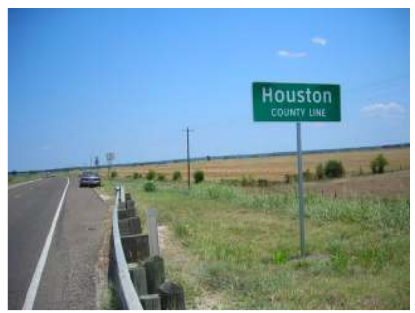
Houston TX (wet line) for KM9X – LC in TX for MG

This was a hot weekend, with record setting temps (104-106) expected in Dallas. Worse tomorrow, so it was just a short trip this time.