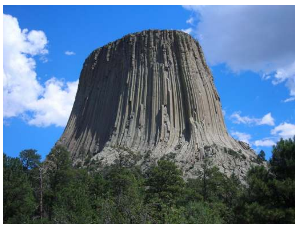
Devils Tower – Crook County WY

The next day, it was too early to head home, so I headed to MT. I did take a detour to stop by the Devil's Tower – managed to drive around it a few times in the past but never get there, and this time I figured if I was in the county (Crook WY) it was time to take a detour. Worth a 50 mile detour!