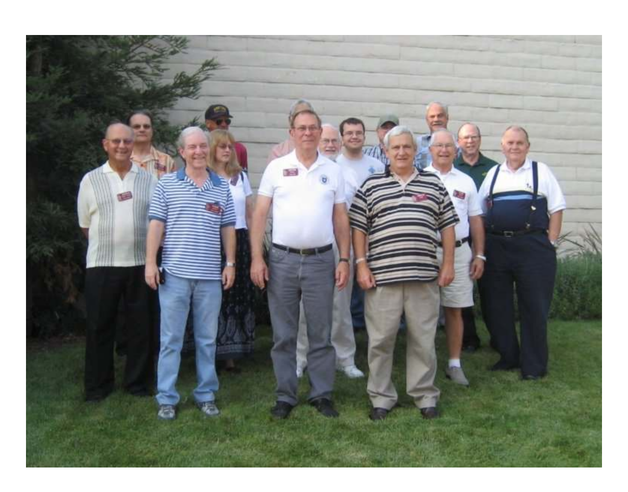
CW Ops at the National Convention

The third item was when a station works a mobile and enters the spot on the spotting network, the group suggested to let the mobile know that they have been/will be spotted. It was suggested to work the mobile and give RST es spot. The mobile can reply RST TU SPOT."