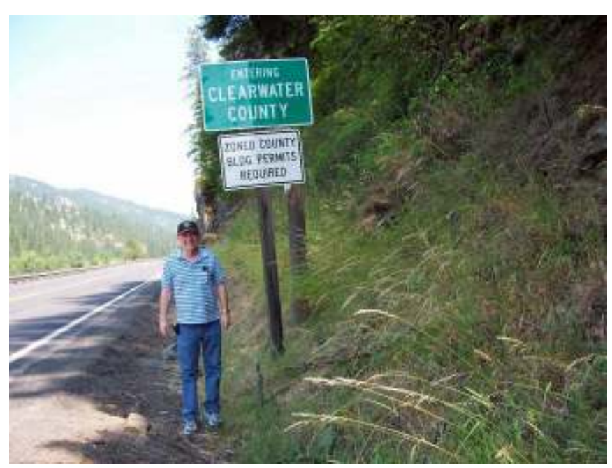
LC WBOW - Clearwater ID for K5GE

After a new set of tires we were on our way north west. Things were going good and by the afternoon of July 3<sup>rd</sup> I was finally in Clearwater, ID. W6TMD had warned me that I might have trouble transmitting from the canyon, but I found a nice park beside the river and signals were very good.