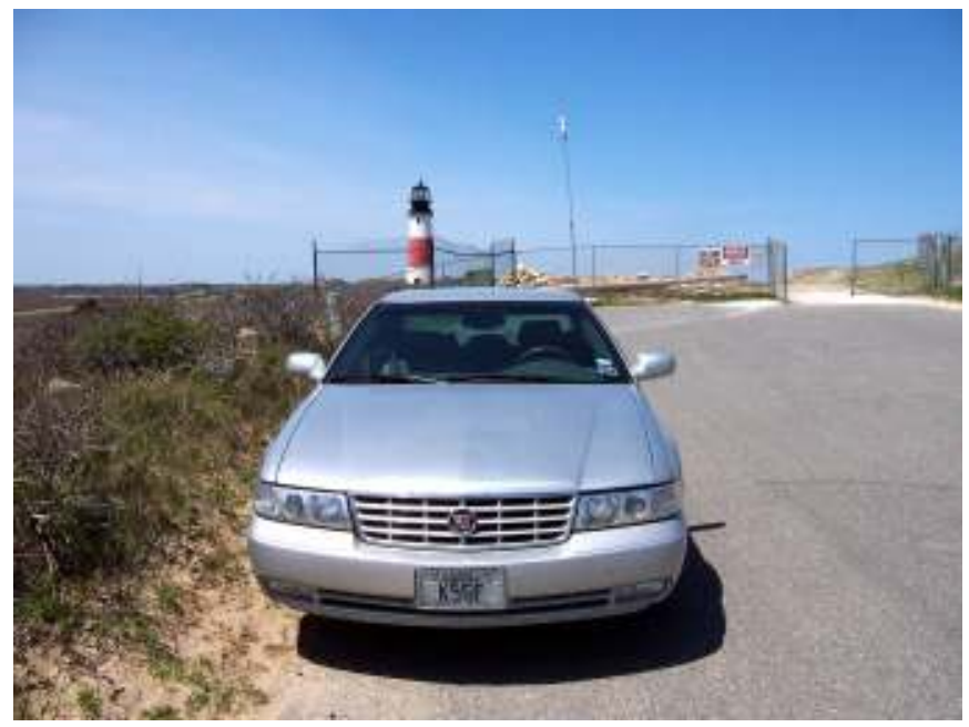
K5GE - Lighthouse on Nantucket