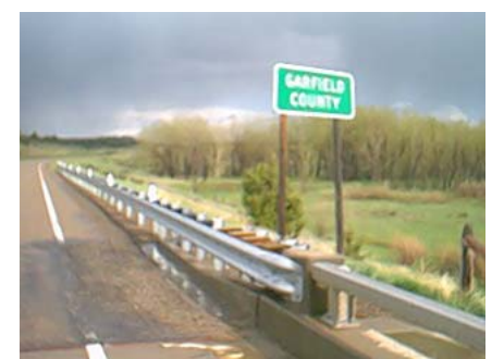
#3077 LC WBOW! Garfield MT

I only had to drive about a mile and I found a great spot. So it is time again to get the mag mount and put it on top of the van, run the coax thru the window, set up, tune, and I am ready to go. Since I was told that I needed to QSY from 14.336 a group of people where waiting for me on 14.343. The first call that I scheduled to make was with N7ID who gave me the next to last contact and saved me over 800 miles of driving. Jack and I exchanged our signal reports with the help of WG6X.