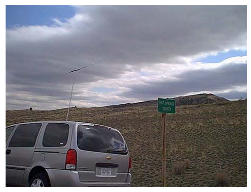
N9STL Temporary Mobile Set up in MT

Thanks to everyone that rode along with me and to all for the people that helped me get the Master Gold Award # 16.