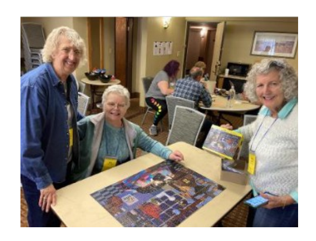
Crossword Puzzle Folks