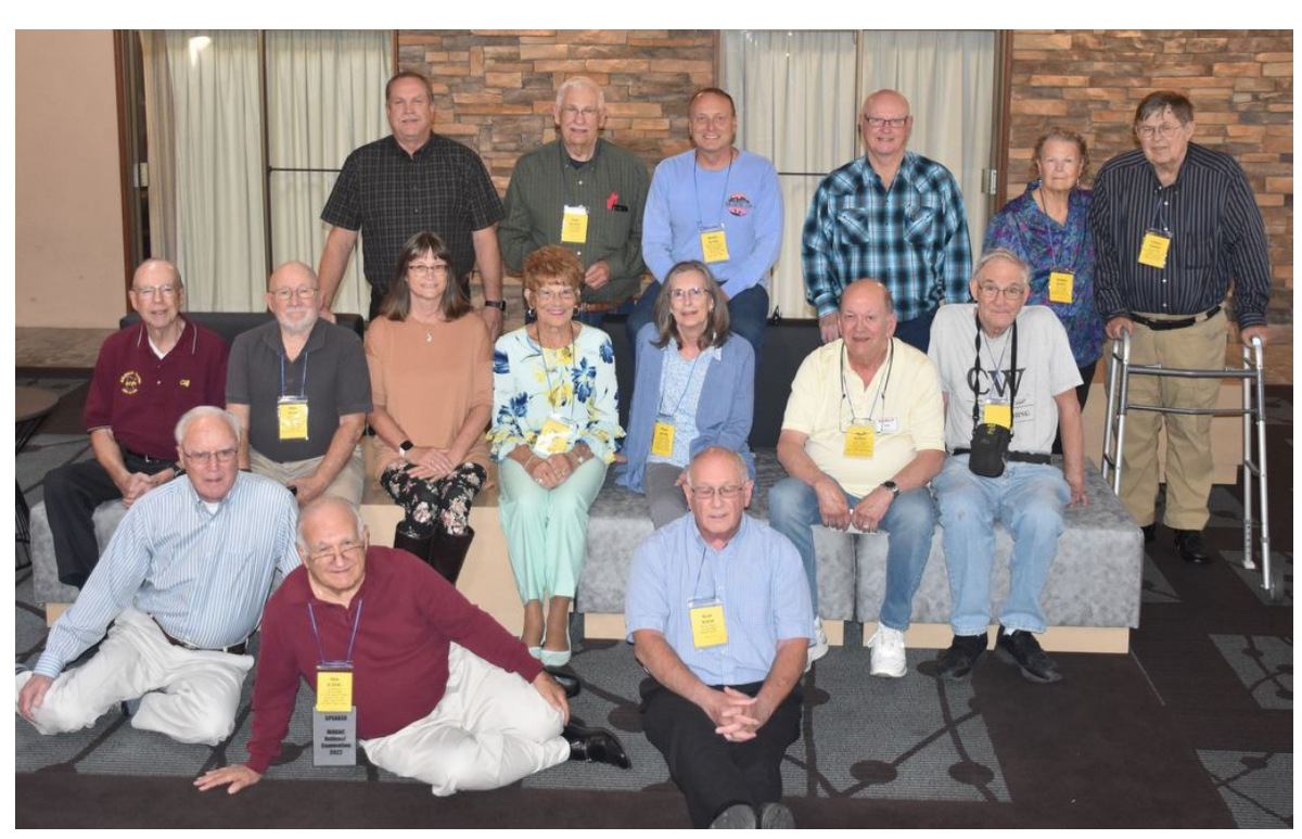
CW Ops at Bozeman 2022