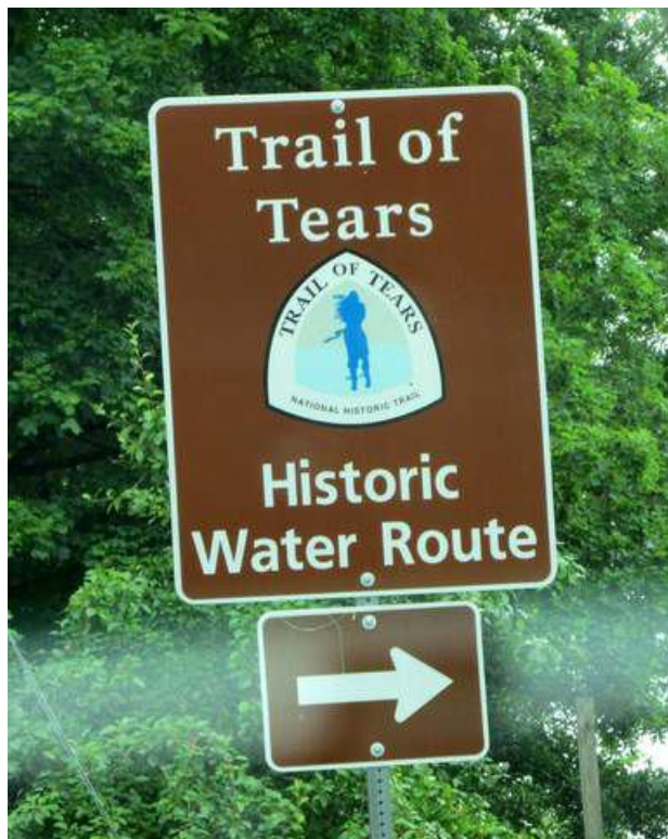
Cherokee Trail of Tears TR12

I saw on Facebook that the 'park' actually consists of a 1/4 mile wide corridor each side of the rivers where boats hauled the Native Americans west from GA to OK. Usually I get within 100 feet of the river.