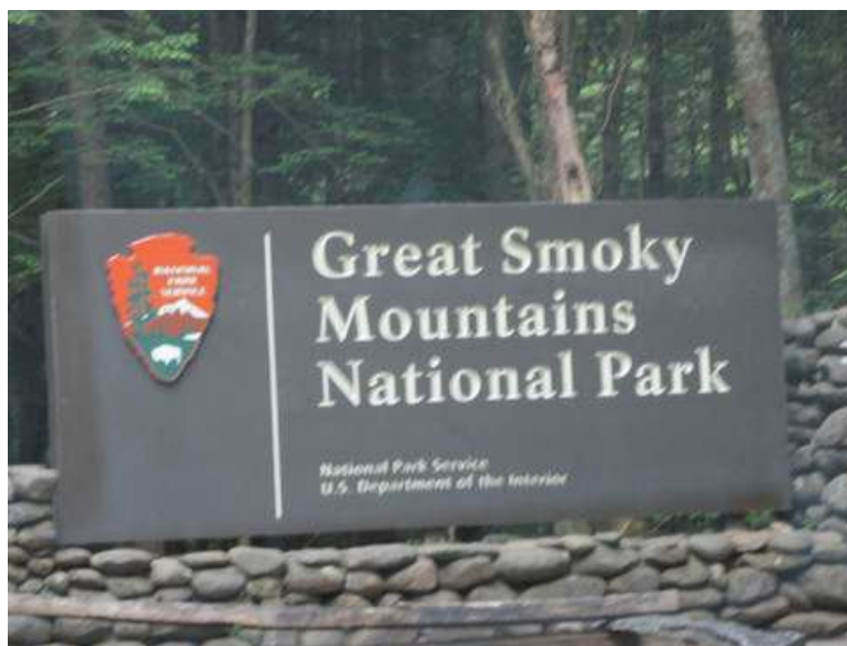
Great Smoky Mountains NP26

You run through a short segment of the park before you get to Gatlinburg. Made 40 QSOs getting into the log late in the day – and would be back tomorrow. Then found the motel. Just parked the car and walked 1/2 mile to a BBQ place down the hill. Slept well. I was actually a bit ahead of schedule so could add in a few more park units. The weather had been good – temps around 55-60 deg for highs. I'd changed to long pants ....and discovered I only brought one pair...the extra pairs didn't get packed. I'd have to fix that.