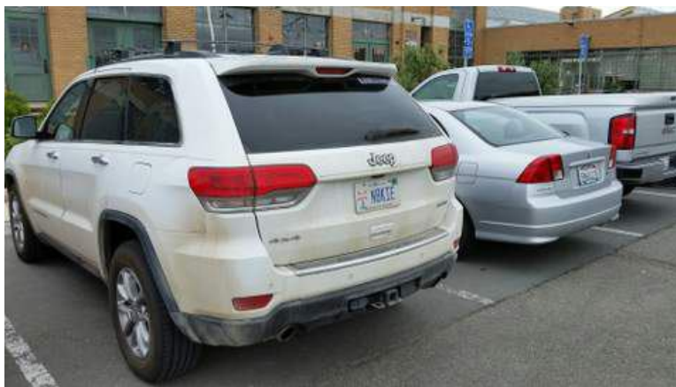
N8K1E at Rosie the Riveter

It's a noisy downtown location but he successfully activated it!