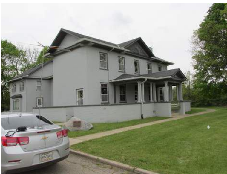
Colonel Charles Young Buffalo Soldiers MN18

West Point, and the 3 rd to graduate. He went on to a distinguished military career – leading the 'all black' Buffalo Soldiers in action in the Caribbean, Mexico – reaching the rank of Colonel. He retired to Wilberforce OH (outside Xenia). There you can visit his home, which is under reconstruction inside, but view it from the outside. There's a nice parking lot and no one around so you have 24/7 access. I got there late in the afternoon – serendipity – and ran it. The home is only open on select days during the year for viewing.