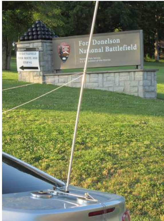
Fort Donelson, TN BF04

I pulled into the visitor center parking lot and put out the park - 75 contacts – then headed to dinner at Mama Meas nearby. Slept well.