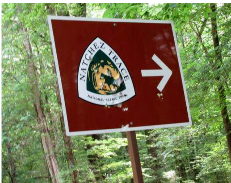
Natchez Trace Scenic Trail TR02