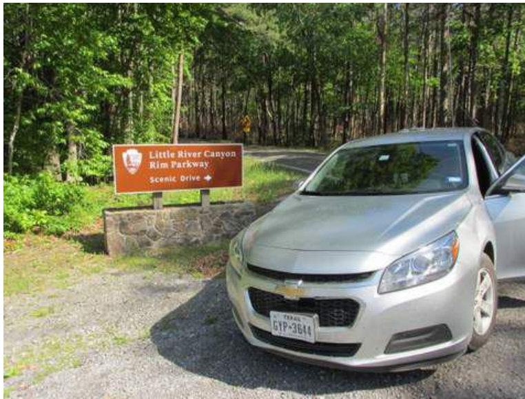
Little River Canyon PV12

[Note: I took pictures of the car at every park I could find a sign, got the passport 'stamp', and signed the visitor log if they had one. A few places I missed when the visitor center was closed, and one or two places just didn't have sign anywhere I could get! Or couldn't stop because of six lanes of traffic! It's good verification. ]