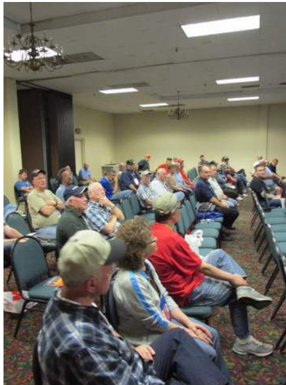
CH Forum Partial view of the room