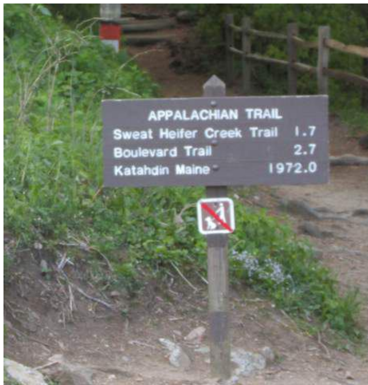
Appalachian Trail TR01

I set up and it takes about 45 minutes to set up and make the needed 10 QSO. Got 11. Fine with me. Pack up quickly. It was definitely chilly out. So far, all but one time I've run a 'scenic trail' its but under 40 degrees! Oh, what one will do for one more 'park activation'. Well, The Appalachian Trail was run once by me, and likely that will be it for me for the entire year! You've got to be within 25 yards of the trail. My portable set up works but you have to work at it to get your 10Qs – or head to a rare location where folks will dig you out of the noise to work you! Also it was a 'two-fer' for NPOTA since this is right in the middle of Great Smoky Mtns as well but since I had run that just before, no additional 'activation' credit.