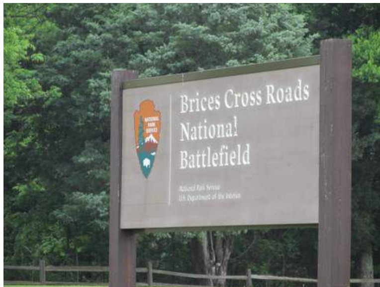
Brices Corner BS01

Brices Corner is also a small site surrounded by 1400 acres of preserved battlefield. The Union managed to keep the confederates engaged in MS, keeping them away from Nashville and Chattanooga and their supply routes. Neither side won a 'decisive' outcome.