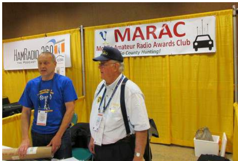
W4SIG KS4BO MARAC Booth

Friday afternoon the rain showers threatened. The flea market closed up in anticipation.....but just a few sprinkles occurred. Later than night, the rain would move it. Rained Friday night.