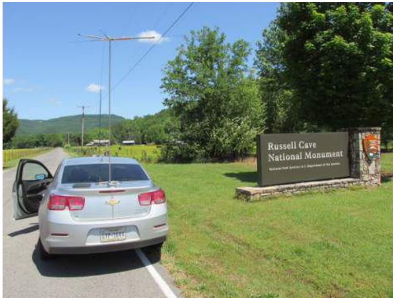
Russell Cave MN64 - Alabama

Heading further south you get to the next park unit – a good one to run!