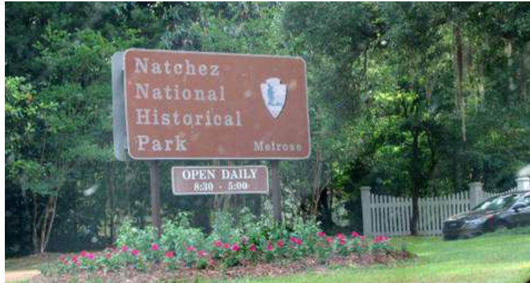
Natchez Historic Park HP29