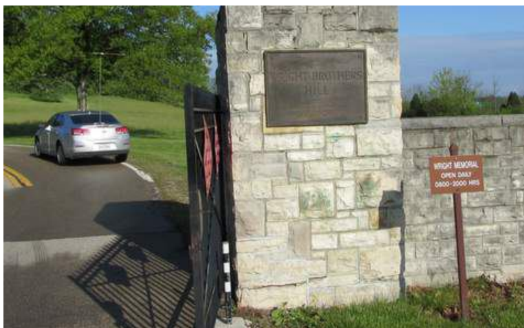
Dayton Aviation Heritage HP11

Today, there are six sites preserved in the area – including their 4 th bicycle shop downtown – and the Huffman Prairie Flying Field and Interpretive Center. After looking at the NPS info, I decided the best chance for a large parking lot and least noise operating environment would be the flying field – which is out by the Air and Space Museum northeast of town. Yes, it was fairly quiet noise wise and a good lot. Had a good run there. 171Q went in the log in short order. Fun!