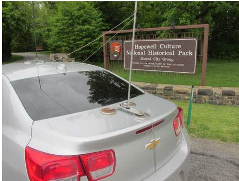
Hopewell Culture - HP15

Put 90Qs in the log in short order. When the pileups were worked down, it was time to head on to one more for the day. The jumper cable from the radio to antenna switch had broken off....so I didn't run a lot of 40M SSB as would have had to change coax cables to the radio every time.....I'd let others run 40M SSB and many would be heading through this going or coming from Dayton. Coax jumpers (PL-259s) were on the shopping list for the flea market.