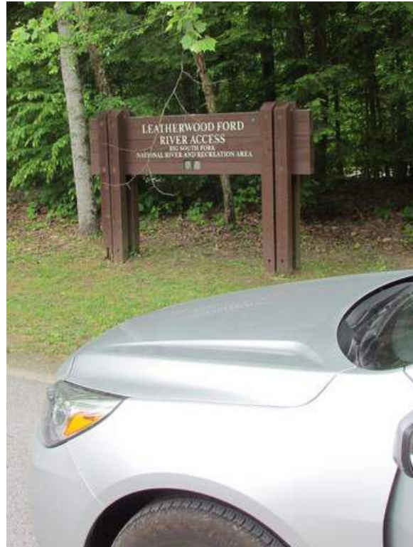
Sign for the landing – RV01 Leatherwood Ford River Access

I managed to get 46Qs in an hour. No cell – no internet. Way out in the boonies. After the run, I drove another 7 miles to the Bandy Visitor Center to get my passport stamp and sign the log.