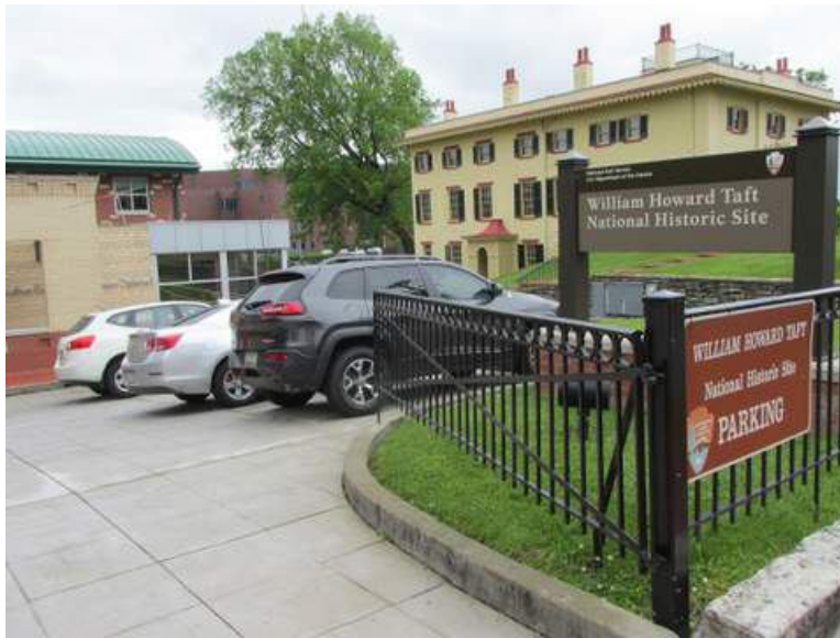
William Howard Taft Home NS-78

OK.....interesting place to visit. I couldn't afford 50c stamps even if he was on it....when I was a kid in the 50s. Things got out of sequence. Washington on the 1c, Adams on the 2c, Jefferson on the 3c, Lincoln on the 16c, and a jump to Taft on the 50c stamp. Then again, how many people would need a 27c stamp? Kids collected – marbles, baseball cards, postage stamps.....and TV promoted things like 'decoder rings'. That's ancient history.