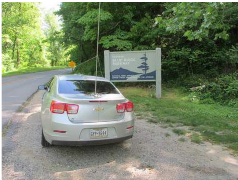
Blue Ridge Parkway PK01

At the south end of Smoky Mtn Park you find the Blue Ridge Parkway – which runs all the way up to northern Virginia – hundreds of miles. I stopped and put it out. It too, has been run and run so I didn't spend too much time stopped running it. There were more interesting things to get to!