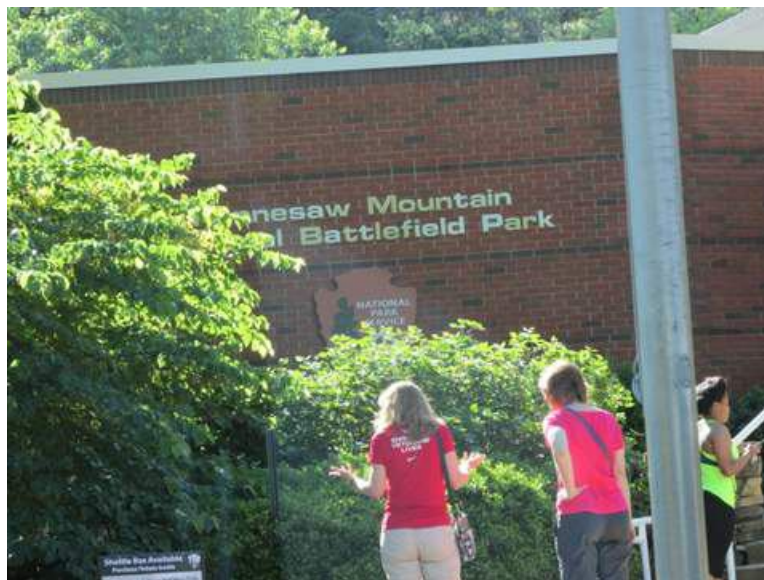
Kennesaw Mountain BP01

This is a 'day use' site with 20 miles of hiking trails. On weekends it is super crowded. I got there at 7:30am and the parking lot for 150 cars was nearly full. People were off hiking, running, and everything else. I found one of the last spots. Get there early! Not too many QSOs due to the early hour, but there have been dozens of activations here.