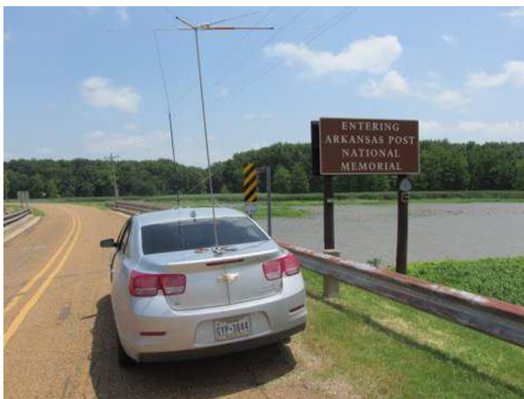
N4CD Arkansas Post

Most of early US history is 'way back east' so it was nice to find a spot 'out southwest' that was a part of early American history. You'll find that if you dig a bit into what all these park units are about, you'll learn a lot of fascinating history along the way. From here one can head south a hundred miles to the corner of Louisiana for the next one.