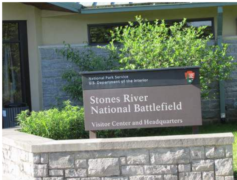
Stones River TN - BF09

Down the road a bit (southeast) you can easily hit two parks in northern AL – and that is where the car headed next.