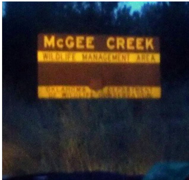
KFF-4818 at 7am – still sort of dark

You take highway 43 east from Stringtown for less than a mile, then get on Greasy Bend Road going east for 11 miles. I have no clue where that road name came from! The first part is a winding paved road – then it becomes a winding gravel road for the second half. Driving conditions OK – you could do about 35 mph on it and it was in good shape. Don't try this after a couple days of heavy rain though – it might be not so great. You take a turn on Cane Break road and arrive after a mile or two. You might not make it during a heavy storm as you have some low spots – stream overflow? - where water has run across the road frequently. Not too hard to find but the GPS lady is ignorant of WMAs so be sure to write down directions. Google Maps will get you there only part of the time.