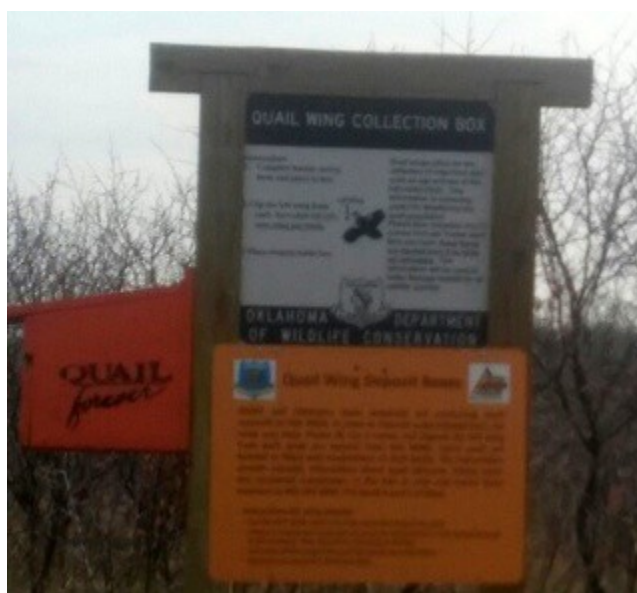
Quail check in station