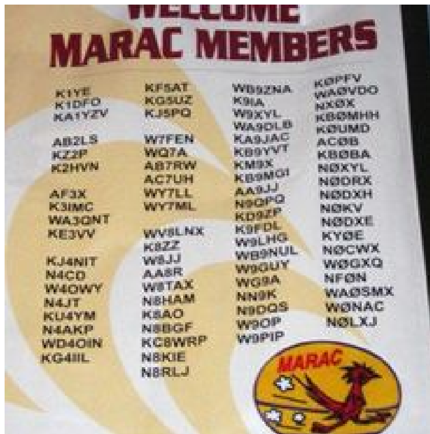
The banner of attendees (not including other non-ham spouses)

The originally planned tour for the mine had to be canceled but Brian NX0X came up with an alternative trip. On Thursday.....we went on a train ride up along the shore of Lake Superior for a few hours. It was great weather – some sat outside, others 'upstairs' in the double decker air conditioned cars.