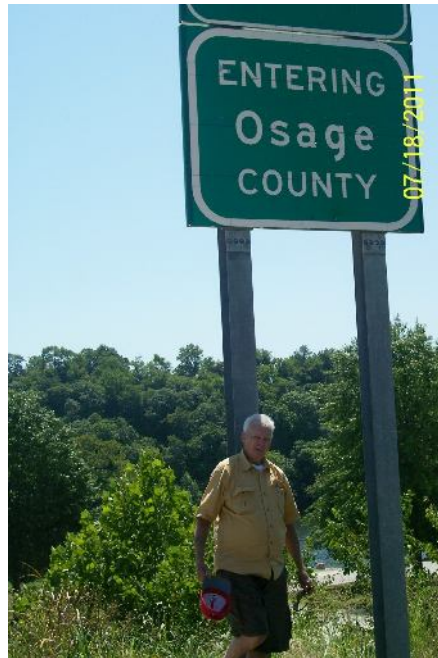
N9QS – Osage MO – LC for W3DYA

Silver, N9QS, spotted out and about in southern MO.