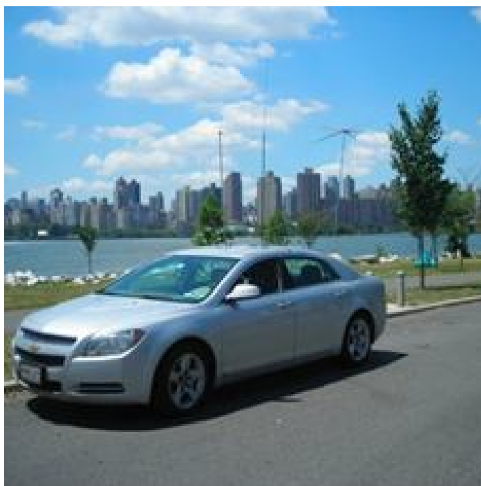
Randall Island (New York, NY) Manhattan Skyline in the Background

I made like a New Yorker and parked in a 'no parking area' to take the pic above but you could park right across the street in a nice parking lot with great radio shot going west! If all the NY boroughs were only this easy and noise free to run!!! (but getting here is not that easy but not all that bad if you stick to the main roads)