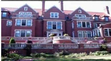
43rd MARAC National Convention Duluth, Minnesota 2011 CW Operators