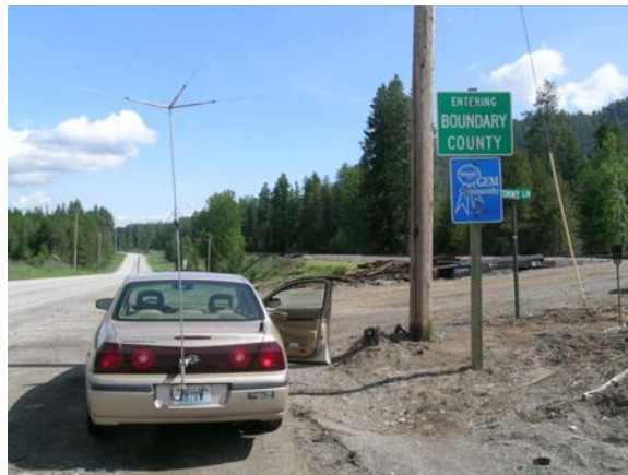
AB7RW on CL Boundary ID 2006