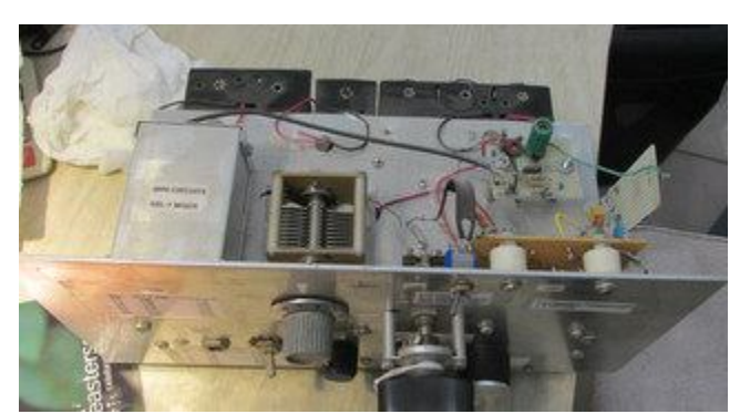
Hybrid regen – found at TX City Hamfest

So...I made the rounds of the hamfest. Oh, there was a nice 'regen type' radio for sale. Was it a true regen? It was a hybrid solid state project – for 40M. The front end was a tune-able down-converter from 40M to a fixed IF of 3.1 MHz with a regenerative detector. The down-converter consisted of a VFO and a double balanced mixer. There were no "IF amps' as such – just a simple set with a half dozen transistors. Well, it followed me home for a very reasonable price. Many amateurs back in the day tried this technique. It's hard to get good performance from a regen as you go up in frequency – you are essentially building a 'VFO' that requires good mechanical design and becomes more sensitive to disturbances (vibration, tuning speed) as the frequency goes up. Regens are not very good above 20M, and indeed many superhets were not good above 20M, so folks put in down converters giving them double conversion receivers. Later, as technology improved, the better superhet receivers went to double, and some even triple conversion (multiple IF frequencies) for the best performance, sensitivity, overload protection, and selectivity.