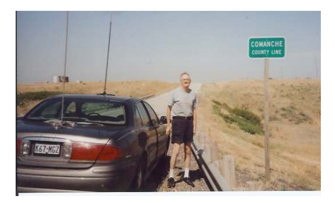
N4CD/m Comanche, KS – last county WBOW for K5VYT