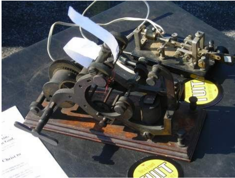
Early Telegraph Register

The telegraph 'register' is what Morse used to start his telegraph system. It imprinted the dots and dashes on a paper tape. It took 15 plus years before the switchover to 'sounders'. The bean counters liked the 'paper record' but the operators hated the need to copy the letters on the tape to a message form when they could do it directly as the code was received. If you have lots of thousands of dollars, you can buy yourself a genuine telegraph register from way back. ($4000 and up with some over 20K depending on rarity).