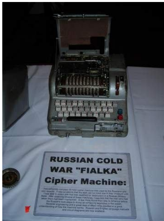
Still 'secret' Cold War era Russian Cipher Machine

It seems in mindless Soviet style 'efficiency' they put all their machines that no longer work into a big pile, pour gas over them and light the pile. After a while, the Sargent sees it burning and goes off to goof off. The workers pull some of the machines out from the bottom of the pile....they are singed on the covers, but the gasoline burns up, not down.....and these show up on the black market for big bucks. The 'soviet machine' apparat still functions like before. Everything is 'under the table'. Some wind up at the Friedrichshaven hamfest if you have the bucks to buy them. They don't work, and you probably have zero chance of getting one to work, no less decode messages, but collectors love them. Note the rotor wheels inside the device.