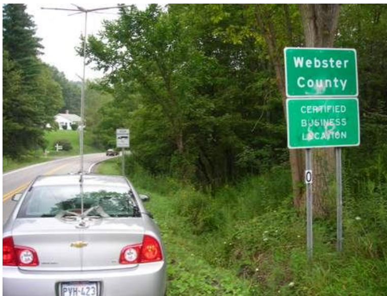
Webster WV – You really have to want to go there! Sort of like Wallowa, OR.