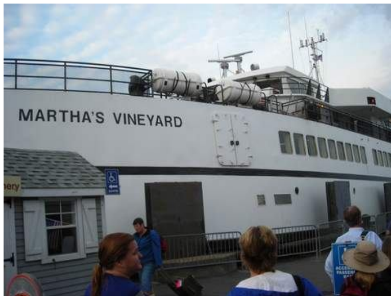
The ferry to Dukes (Martha's Vineyard)