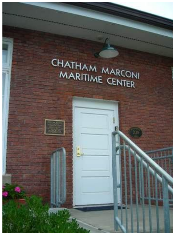
WCC Museum in Chatham, MA