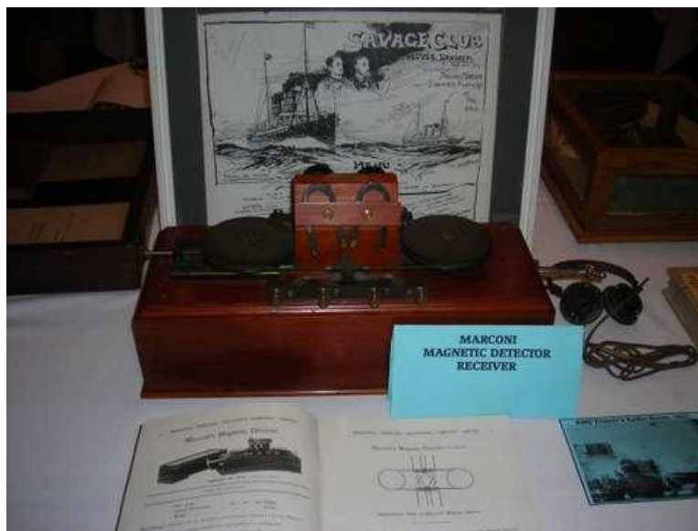
Marconi Magnetic Detector - Maggie

Well.....it turns out, not so. On one of the recent dives to the wreck of the Titanic, a small robotic cameras ( Elwood and Jake) went into the Marconi room (and the adjoining 'silent room' that held the spark gap transmitter) and found that certain pieces of equipment, not visible in the 'one' photo, were actually in the silent room and not in the main room. Different from the Olympic. They were the control panels for the motor generator and voltage regulators. Most of the wood has deteriorated but one can pick out all of the remains of all the parts of the transmitter and receiver and their locations. There were some surprises. There were half a dozen talks on the technology of the Titanic radio, the exact message traffic exchanged, etc, plus an interesting talk on how all of the pieces had been assembled for the Branson museum exhibit. That took years and years of collecting to assemble. One of the important items comes up for sale (or trade) maybe once every 10 years.