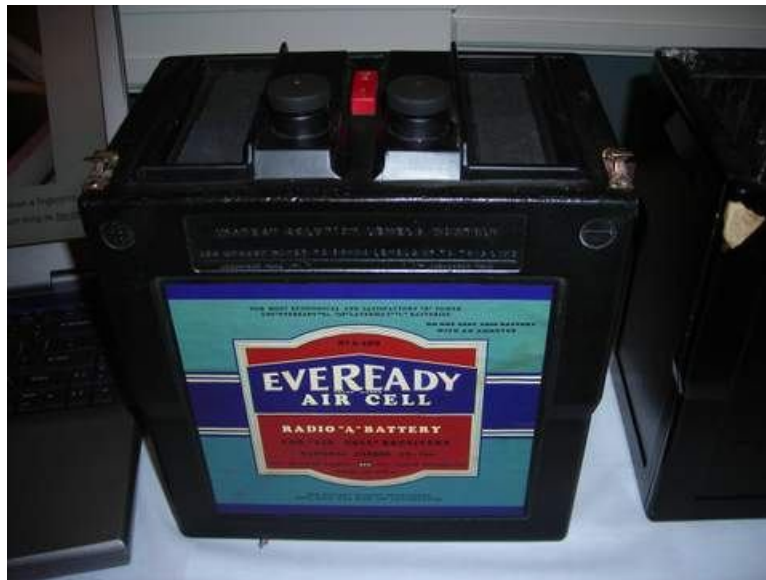
3v 600 Amp Hour Plus Battery “Dry Cell”

tube set, taking up to 675ma of battery voltage to run the filaments, a very heavy duty battery was needed. EverReady came up with the Air Cell which was GUARANTEED, when used in a 'certified radio' like the farm oriented Atwater Kent, that it would run the filaments for at least 1000 hours. Let's just pick 1/2 an amp – for 1000 hours- that is 500 AH! This from a throw away battery. They sold for about 6 bucks in 1935, but you wouldn't need to buy another one for years and years. They were about the size of a small car battery, but carbon zinc. They had 'open air' construction where they needed no depolarizer chemicals. As the farm radio need faded, there was no longer a need for the giant 'dry cell' type batteries and there seems to be no advertising after 1937. The REA – rural electrification administration was rapidly hooking up everyone to the grid.