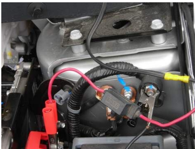
Battery Hookup – Dodge Journey – Clip Leads