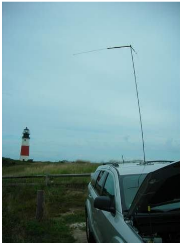
Nantucket – Dodge Journey – 7 foot ant

I found the light house road. I parked and got out the bag. Assembled the big antenna and put it on the roof, which is a big one and high up. Great for radio work. Hooked up the power cable to the jumper post. The battery was buried down in the lower front corner of the car. You could see it and you could see the terminals but it would have been hard to get a clamp onto the terminals. I hooked the ground to a convenient other ground screw.