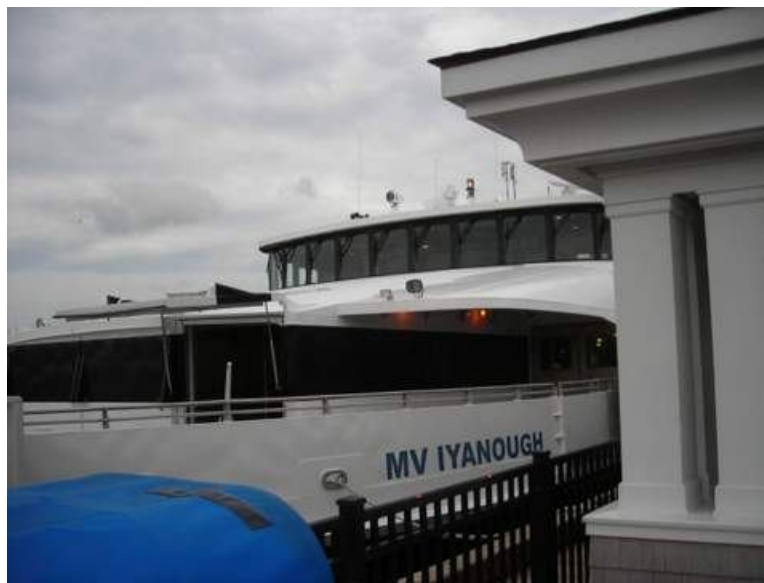
MV Iyanough – Fast Ferry

This is one of a few ships they use for the 'fast ferry'. Zips along at 40 mph!