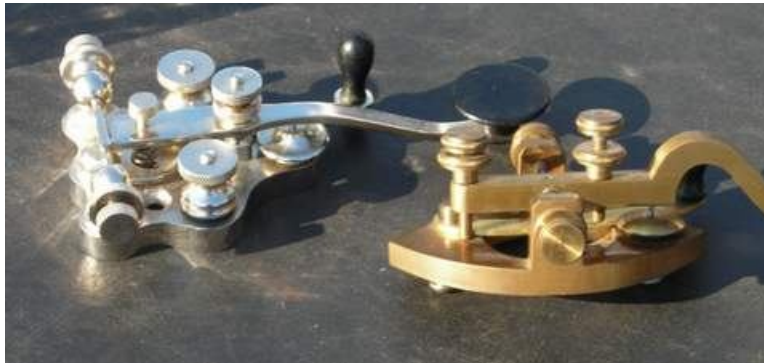
Lewis and Camel Back keys – 1860s/1870s

On Thursday there was a flea market. It was disappointing as fewer and fewer seem to show up. If you had some big bucks, you could buy: