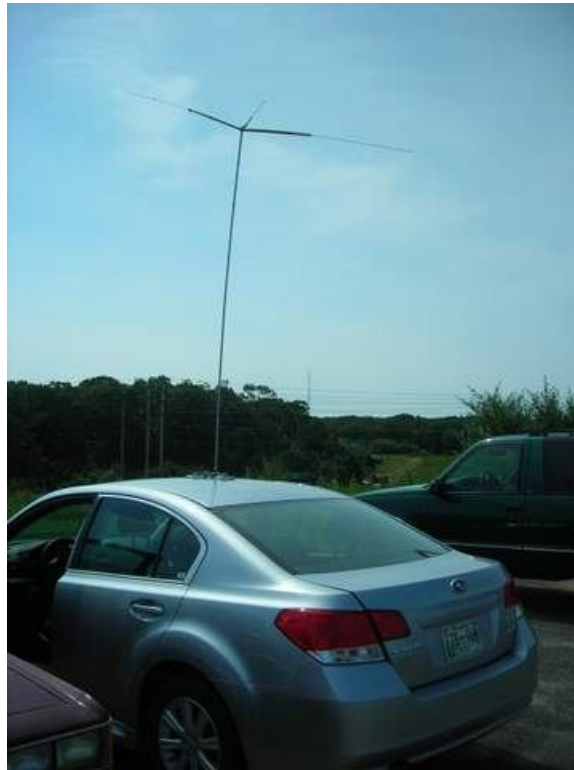
N4CD Tisley Park and Ride Lot – Dukes

less of a problem on CW but noise with engine running still there wiping out the weak ones. Remember: Subaru Legacy – bad news!....Don't buy one!