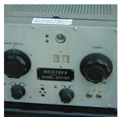
Meissner Signal Shifter Transmitter (low power0

This rig covered 80/40/20 meters with 'SSB and CW' – I don't think there was a cw filter. You could buy an optional noise blanker module and crystal calibrator. 100W solid state – vintage 1970s.