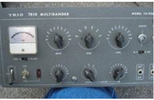
Trio Multi-bander Transmitter

This was a 'before Kenwood' transmitter – the unit for sale had no tubes, no cabinet, and no documentation. It would have been a major project likely to resurrect it. Interesting, but I don't know if anyone bought it.