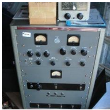
Globe King 500 transmitter

A few Multi-Elmac old mobile units were there. A weird Trio transceiver – pre Kenwood in bad shape was for sale. There must have been 25 Hallicrafters receivers there, a Hallicrafters transmitter or two, half a dozen National receivers and a transmitter or two, probably 2 dozen linears from SB-200s to P&H to Nationals, and all sorts of other accessories from station monitors to wattmeters, SWR meters, etc. There were Johnson rigs, an Alda 103, lots of ICOM and Yaesu HF stuff, and a few things I've never seen before. I didn't bring any of them home! Some nice Knight Kits were for sale – the R100A receiver (a pair in mint condition), lots of power meters. Probably 10 mint looking Collins radios, plus some AM KW stations. You could buy war surplus ARC-5s of all types.