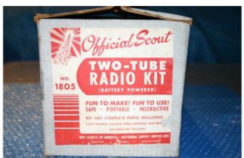
How it arrived on your doorstep

One of the things about the Air Champ Series was the box that it was shipped in! It was used as the enclosure for the radio. Here's the box for the two tube radio. You'll note the radio, which is built on a pine board, is then placed in the bottom of the box, and the controls pushed through the front of the box. There's a cutout for the speaker! This is for the 2 tube set which could drive a speaker. (It's the shipping box!)