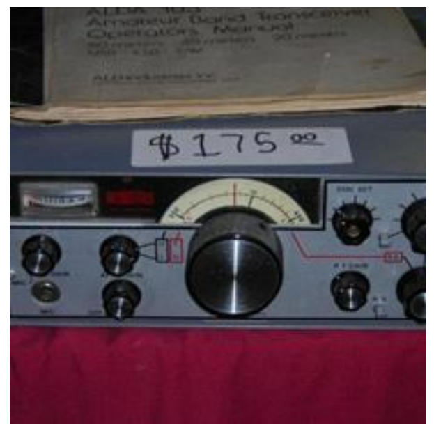
Alda 103 Transceiver

This rig covered 80/40/20 meters with 'SSB and CW' – I don't think there was a cw filter. You could buy an optional noise blanker module and crystal calibrator. 100W solid state – vintage 1970s.