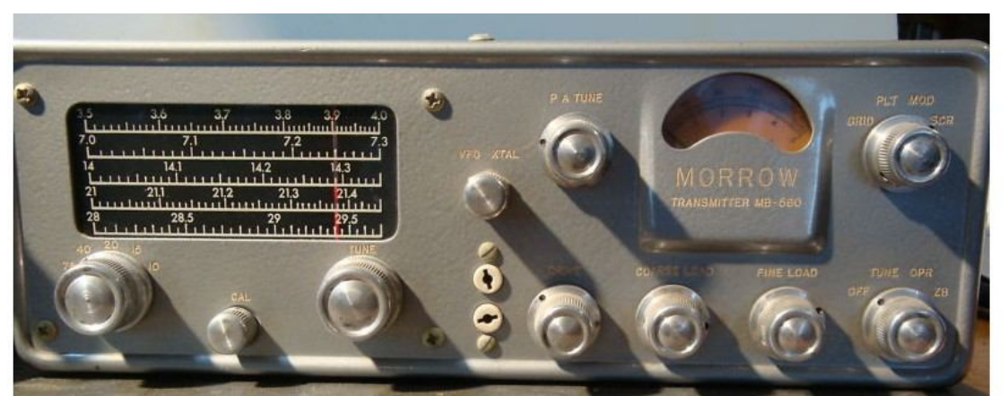
Morrow MBR -560 Transmitter

More pictures of the Morrow Equipment, including the insides at