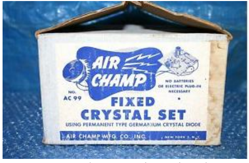
The way it arrived

Here's the crystal version of the Air Champ Series - the AC-99