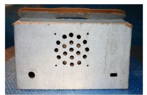
The shipping box, complete with carrying handles

Even the crystal radio went 'into the box'. You'd bring out the antenna wire, ground wire out the back, and the lone tuning control stuck through the front panel by itself! You would have a 'portable set' to take out on your camping trips!