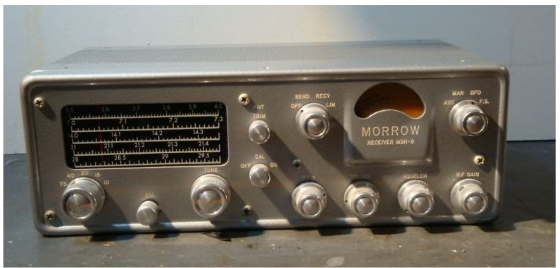
Morrow MBR-5 Receiver