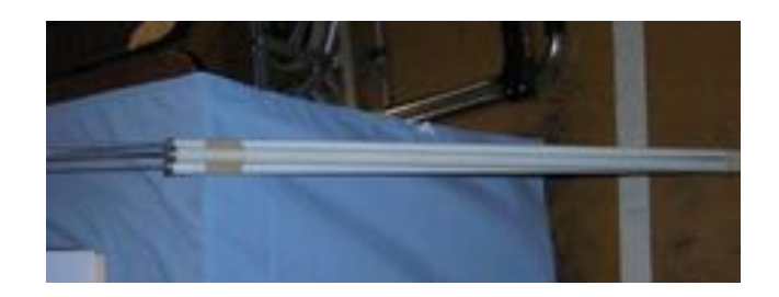
TenTec Hamstick Type Antennas

I didn't know that Ten Tec sold mobile/portable antennas way back when – hamstick type antennas for mobile use – 20/40/80M for $30. I passed. They were not flexible so I'm not sure they'd be too great mobile unless you mounted them on a spring – just in case you hit something. Otherwise, you'd likely break the mount or cause body damage. Maybe that is why they weren't too popular.