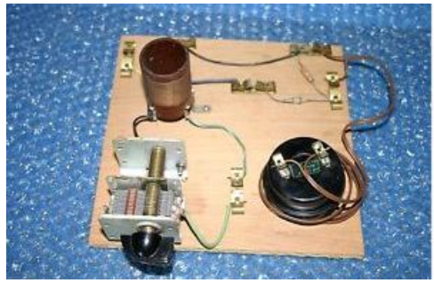
The built unit

One of the things about the Air Champ Series was the box that it was shipped in! It was used as the enclosure for the radio. Here's the box for the two tube radio. You'll note the radio, which is built on a pine board, is then placed in the bottom of the box, and the controls pushed through the front of the box. There's a cutout for the speaker! This is for the 2 tube set which could drive a speaker. (It's the shipping box!)