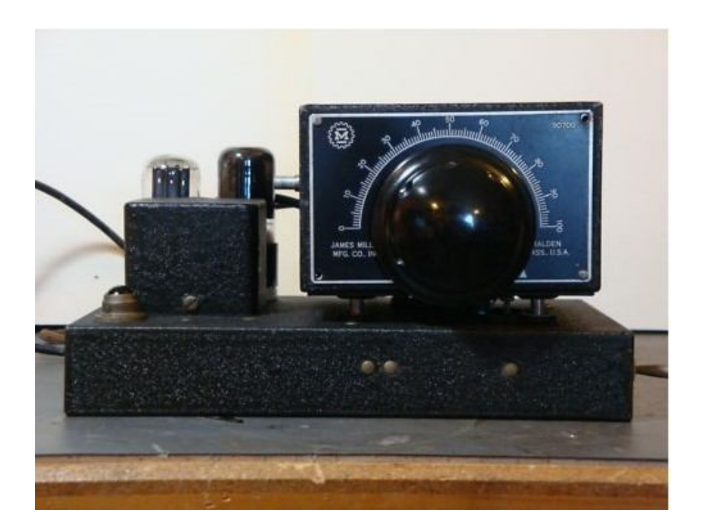
Rare Millen 90700 Vari-Arm VFO circa 1945

The Millen Variarm Electron-Coupled Oscillator made its appearance in the mid-40's. It is the commercial version of a unit presented in the January 1941 QST (cover article) designed by Henry Rice W9YZH. The 90700 was designed to operate on the amateur 160, 80 and 40 meter bands. Two wiring flavors were offered, that could be changed by the user, with the 90700 wired for 80 and 40 meters and the 90701 for 160 and 40 meters.