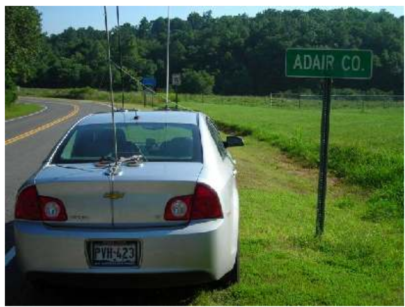
Adair/Delaware for W8DCD – LC OKLA He's getting closer to finishing!

but with help from friends, we exchanged 55 reports from the county line of Adair and Delaware.