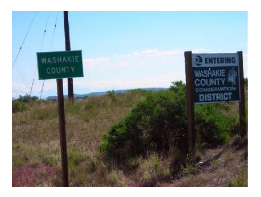
Washakie, WY - LC WBOW MG for WB0CQO

It's a long way, but I made it up to Carbon, MT, then up to Yellowstone MT and north from there. After getting wound around on city streets by the GPS in Billings, I made it out of town headed up to Golden Valley. Dang – construction zones were everywhere with pilot cars and long waits – 25 minutes one time, and 15 minutes a second time. The third time was only a few minutes. Even worse, at the long wait, I could see the next county line 500 feet ahead, but, alas, had to wait and wait to get there! I finally got to ran Golden Valley, then a quick east leg to Musselshell. Wow, I started on 17m and what a pileup with over 20 stations in the log on cw there. I ran 20SSB and of course, 20, 30, 40cw. Not much action on 40M, but for the folks who could not hear me on other bands, that's all the difference in the world, even if there are only 2 or 3 contacts on 40CW.