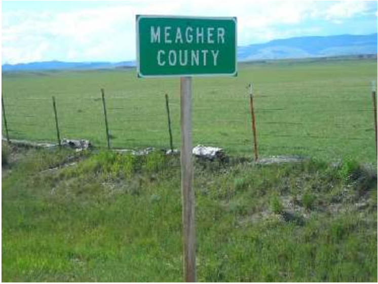
Meager MT – LC WBOW for W0GXQ 4<sup>th</sup> Time

I ran the bands, then pointed the car back to the motel 22 miles back. Hmmm...rain, lighting, road full of water, and a rainbow. I slowed down, and got back into town, gassed up the car, hauled the things into the room, and went off to the Café for dinner. Not too many choices here- like two places for dinner, or a fast food joint or two. I had the pot roast – it was very good. Hit the sack early.