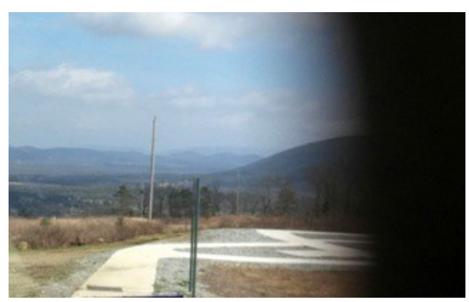
Pushmataha shooting range

I found the WMA – good signs to get you there – and headed 'up' the ridge to a nice shooting range right off the road – both target and skeet shooting area. You're way up with a great shot going east – and great for working EU. However, not all WMAs are so easy to find. This had good signs right off the main highway to get you there. You have a couple mile good gravel/dirt road in. 73F and cloudy/hazy but great view before the cold front hit later this day.