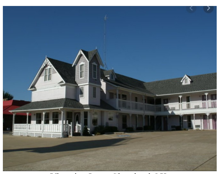
Victorian Inn – Cleveland OK

Checked around and no Wyndham properties within 40 miles to the south - so stayed nearby in Cleveland, OK at the Victorian Inn – an older property but decent - $57 for the night.