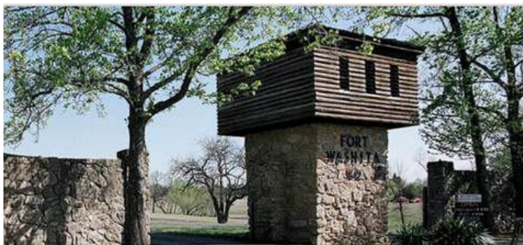
Fort Washita, OK

You can go inside and look around if you want. Free admission and open 9-4:30 most days. Been there and done that so I just waved as I went by.